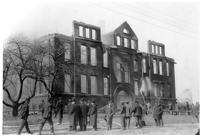
The smoldering remains of Lakeview Elementary School after the Collinwood school fire, 4 Mar. 1908.

The initial report claimed that the rear doors of the school opened inward, and the children were unable to open them because they were jammed against the doors by the other panic-stricken children pushing from behind. Both the coroner's inquest, which included reports from witnesses and the architects who designed the building, and a physical examination of the building proved that the outer doors did open outward in accordance with the law at that time. The report on the fire concluded that the children's failure to escape resulted from their own panic. The fleeing children became wedged tightly on the stairs behind a set of inner vestibule doors which were narrower than the outer doors. The horror of the Collinwood fire caused numerous school inspections across the country, which resulted in stricter laws.